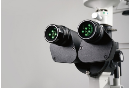
HD Optical System